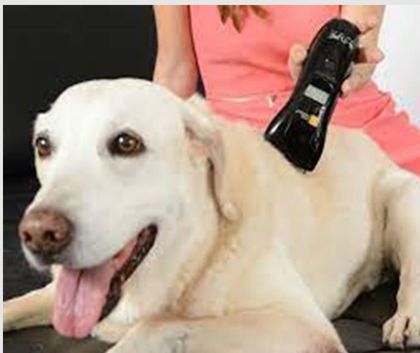
Figure 4: Treating shoulder strain.

Clinical trials hosted by veterinary practices using B-Cure Lasers for the at-home treatment of joint, hip, and spine pain and osteoarthritis are underway. The studies are exploring the ability of LLLT to reduce inflammation and associated pain and to promote healing of both acute chronic conditions. Results will be published as soon as available [27].