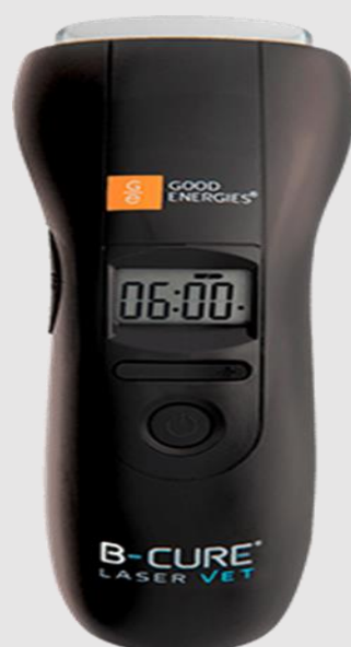
Figure 2: B-Cure laser vet device (Courtesy GOOD ENERGIES USA INC.).

The B-Cure Laser was cited in 4 of the 14 clinical trials investigating wound treatment and pain with LLLT. Twenty-nine percent of the study patients in the review literature received treatment using the B-Cure Laser device (Fig. 2).