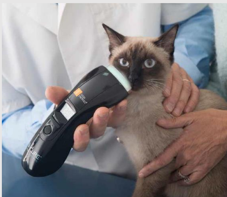
Figure 3: Positioning for LLLT treatment of feline gingivitis.

Clinical trials hosted by veterinary practices using B-Cure Lasers for the at-home treatment of canine and feline gingivitis (Fig. 3) are underway. Results will be published as soon as available.